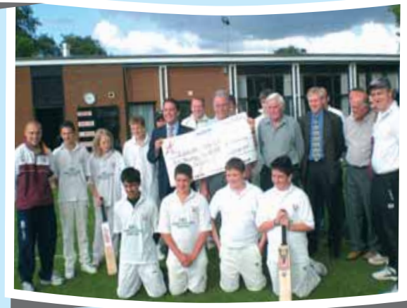
Presenting a Community Lottery Award Campaigning for local regeneration