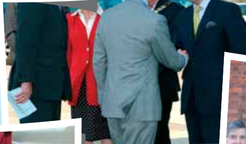
Welcoming The Prince of Wales to the constituency