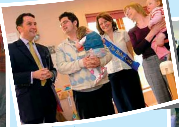
Calling for comprehensive childcare provision