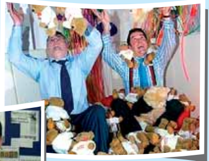
Fundraising for our children's hospice