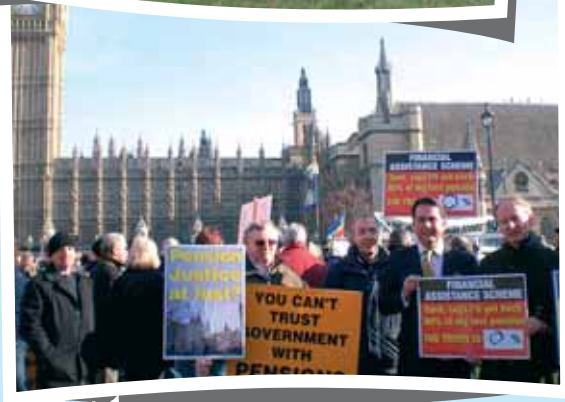
Lobbying for local pension groups