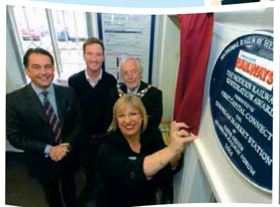
Unveiling a plaque for outstanding service