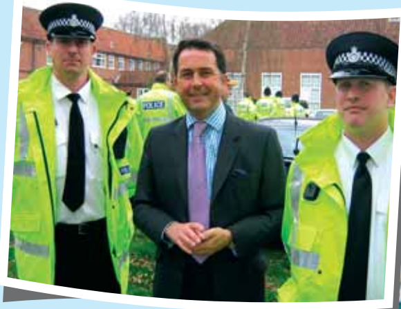
Fighting for a stronger police presence on our streets