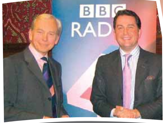
In touch with the media